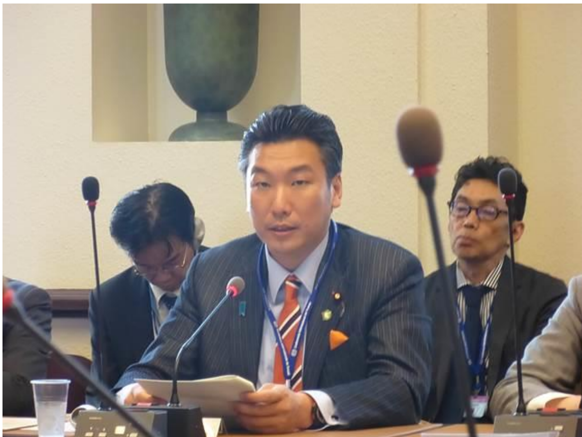
State Minister Hashimoto speaking during a meeting of the ILO Asia Pacific Group Labour Ministers