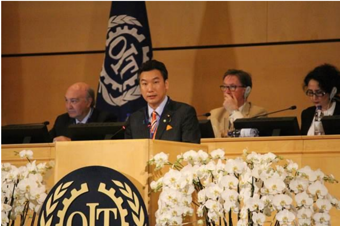
State Minister Hashimoto making a statement during the Plenary

The 106 th Session of the International Labour Conference was held from 5–16 June at the headquarters of the United Nations among other venues in Geneva. Mr. Gaku Hashimoto, State Minister of Health, Labour and Welfare of Japan, attended and spoke at the conference.